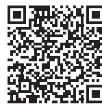
Python EZ A/C Care

547000001-20AR Python EZ AC Care 12–20 oz. Aerosol Cans