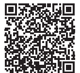
Digest Plus Aerosol