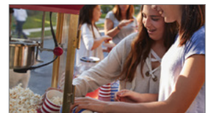
264802 KETTLE TABS™ Popcorn Kettle Boil-Out Cleaner