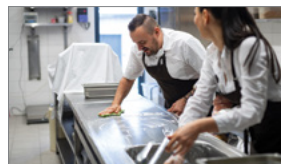
5260 MAIN EVENT Food Surface Foaming Cleaner/ Degreaser