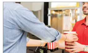
20301 NU-VIEW Concession & Food Equipment Cleaner